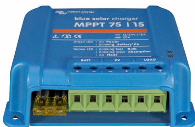
Solar charge controller MPPT 75/15