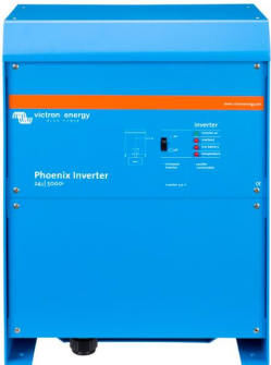
Phoenix Inverter 24/5000