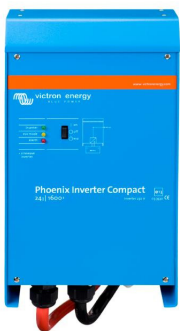
Phoenix Inverter Compact 24/1600

The possibilities of paralleled high power inverters are truly amazing. For ideas, examples and battery capacity calculations please refer to our book "Energy Unlimited" (available free of charge from Victron Energy and downloadable from www.victronenergy.com ).